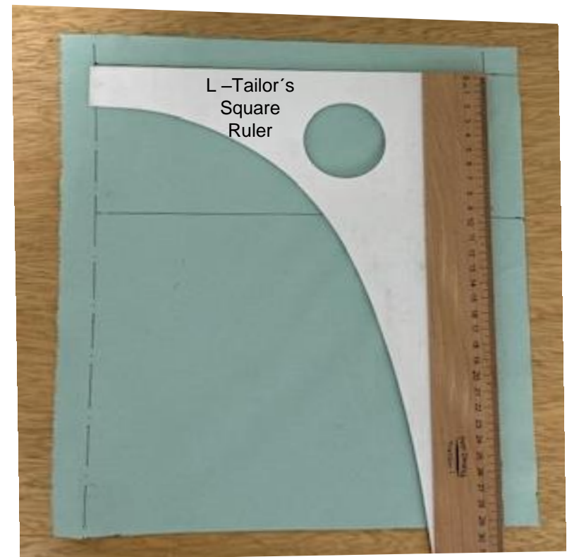
Inspection of the rectangular structural network.